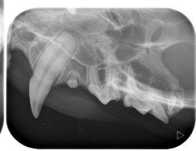
Intraoral Bisecting Angle 204