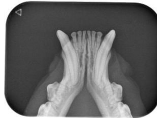
Intraoral Bisecting Angle Occlusal view 301-304,401-404