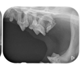
Intraoral Near Parallel Technique - mesial root separation 208