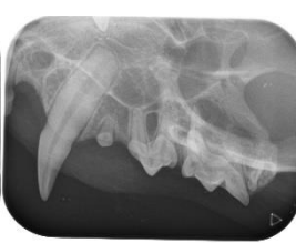
Intraoral Near Parallel Technique 206,207,208,209