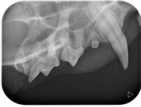
Intraoral Near Parallel Technique 106,107,108,109