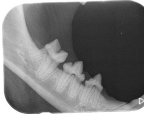
Intraoral Parallel Technique 407,408,409