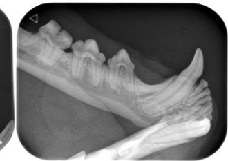
Intraoral Bisecting Angle 404