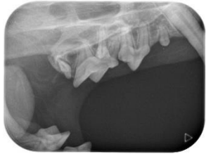
Intraoral Near Parallel Technique - mesial root separation 108