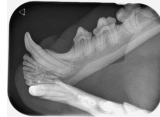
Intraoral Bisecting Angle 304