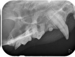
Intraoral Bisecting Angle 104